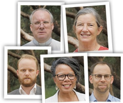
Diocese of Parramatta Laudato Si' Action Team